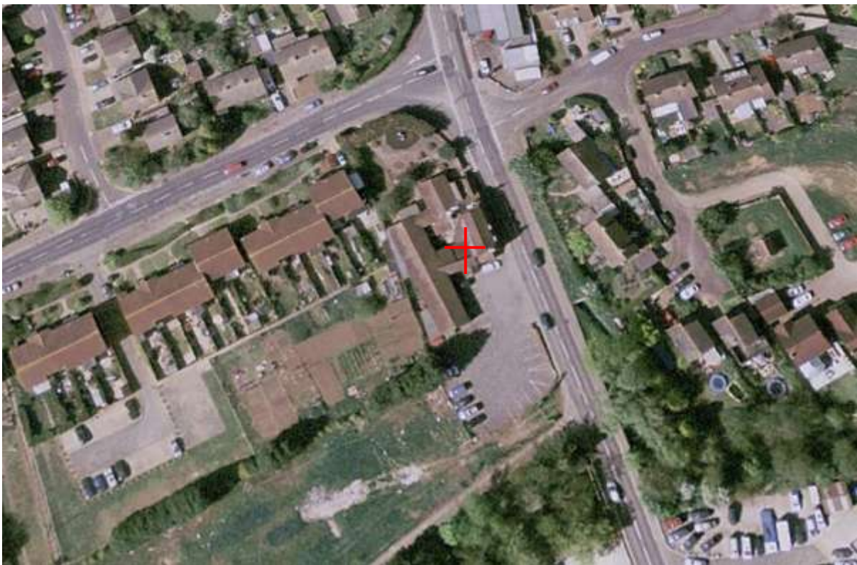
Plate 1. Aerial view of site (red target) showing the site prior to development.