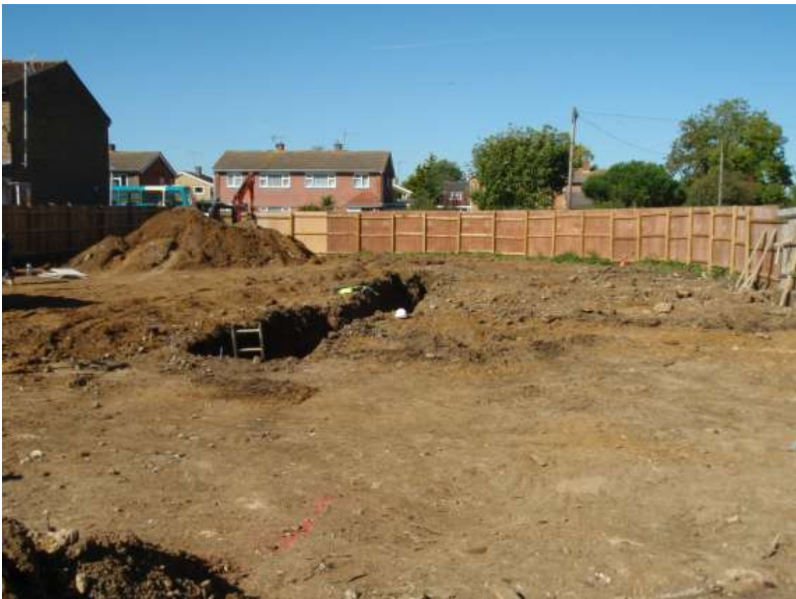
Plate 3. View of trenching (looking N)