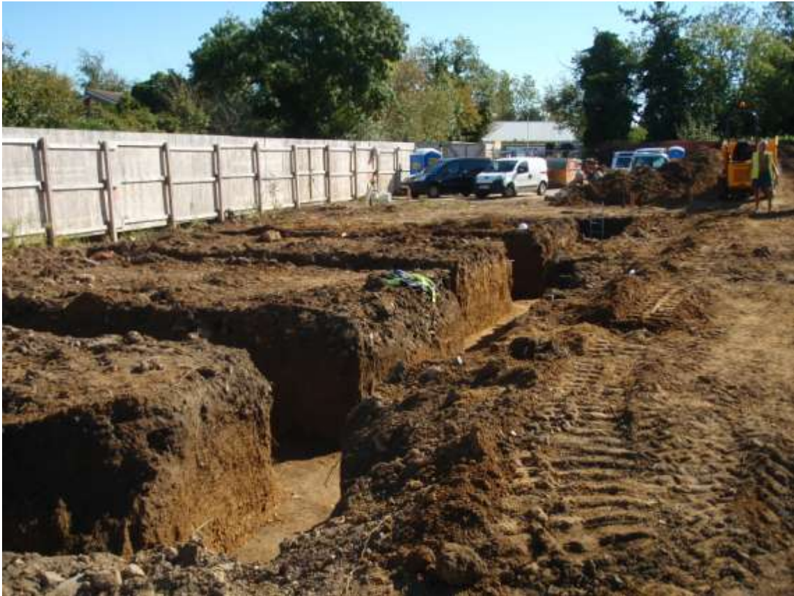
Plate 2. General view of site (looking S)