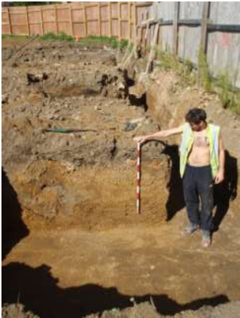
Plate 5. View of the trenches (looking N)