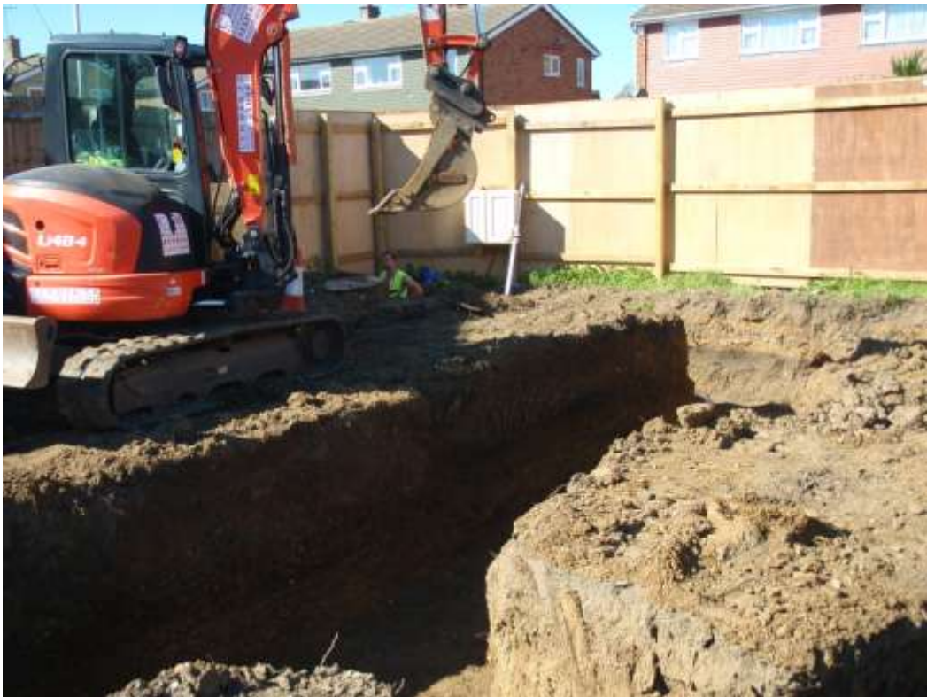
Plate 7. View of the trenches (looking N)