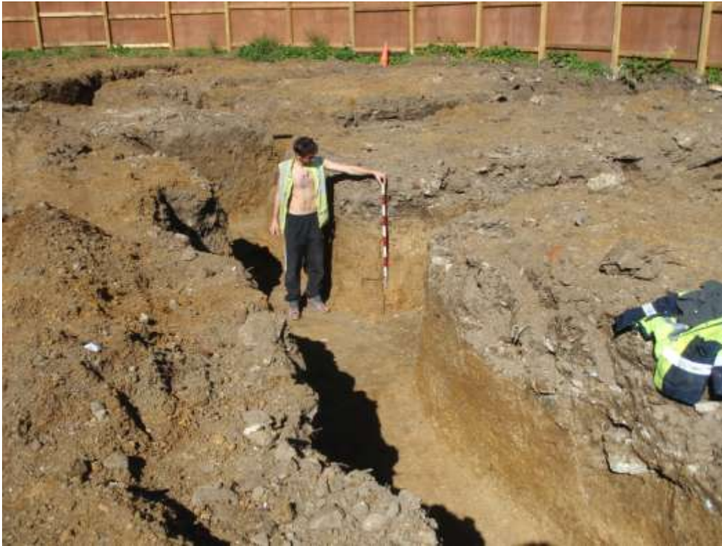
Plate 6. View of the trenches (looking N)