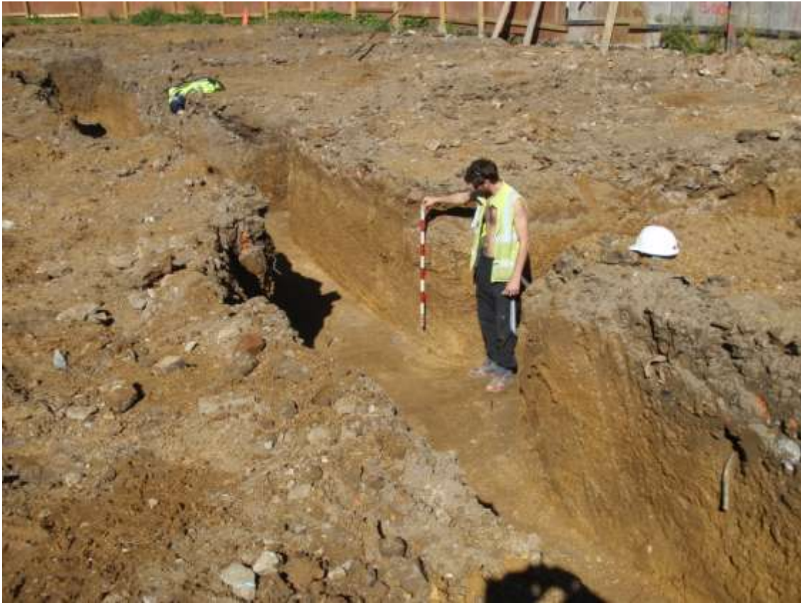
Plate 4. View of foundation trenching (looking N)